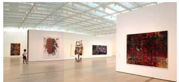
Installation view. "Variations: Conversations in and around Abstract Painting." LACMA