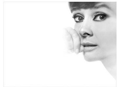
Audrey Hepburn, Paris, 1965.

Last year, I went to the signing of Douglas Kirkland's book, A Life in Pictures . He is one of Hollywood's best-known photographers, with almost 50 years of capturing priceless moments in the history of movie making. His 1965 photo of Audrey greets me every time I enter my apartment. However, my debt to Audrey goes even further. It's difficult to believe, but Hollywood beat Moscow by 10 years by the very fact that King Vidor's film, War and Peace , came out in 1956 while the Russians only managed to come up with their version a decade later, in 1966. So, here goes Audrey again, playing the title role of Russian princess, Natasha Rostov, in an American retelling of Leo Tolstoy's famous novel. I was in my early teens then, still hadn't read the novel, and Audrey was the one who introduced it to me.