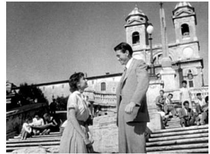
Audrey Hepburn and Gregory Peck in Roman Holiday , 1953.

I've been in love with Audrey Hepburn all my life. Well, not really all my life, but at least since the moment I saw her in William Wyler's 1953 classic film, Roman Holiday . I was just a kid living in Russia, and I could only dream about traveling to Rome. With the exception of high political officials, no one was allowed to travel abroad. Last Sunday, I went to the Hammer Museum for a screening of this favorite movie of mine and, once again, Audrey Hepburn and Gregory Peck did a fantastic job being my cicerones, my personal tour guides to the Eternal City.