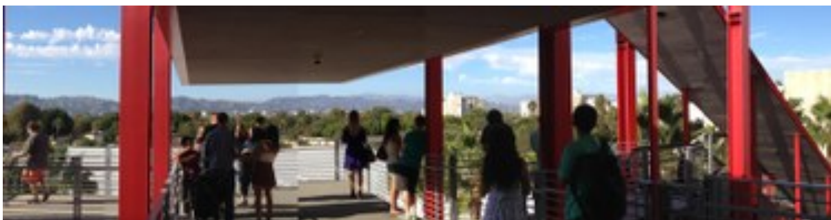
View of Los Angeles from LACMA's Broad Building