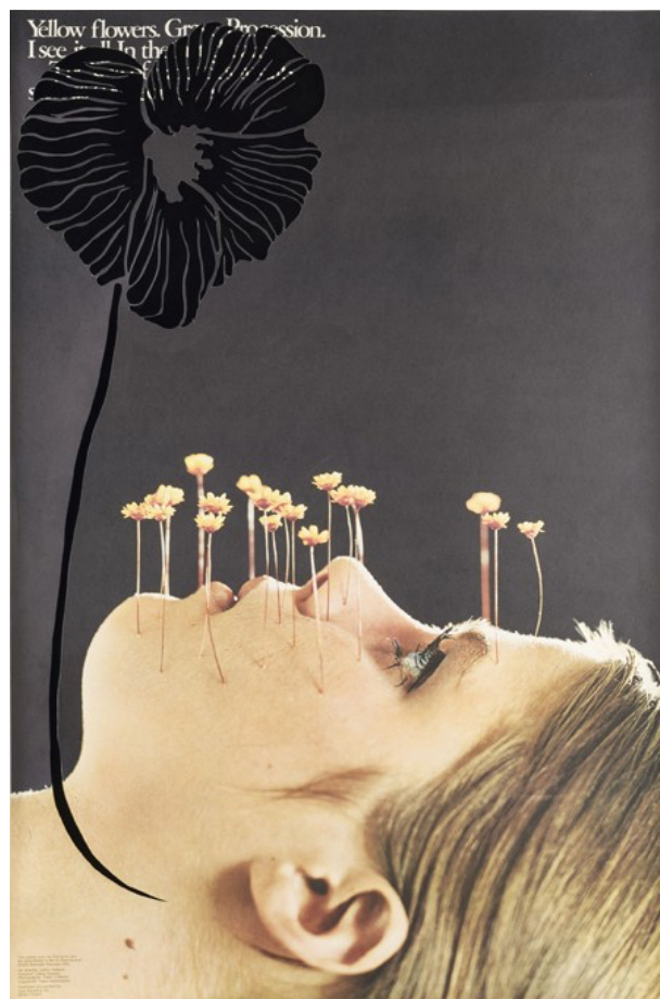
Yellow Flowers. Grave. Procession., 2015, paper and velvet, 47 x 32 inches