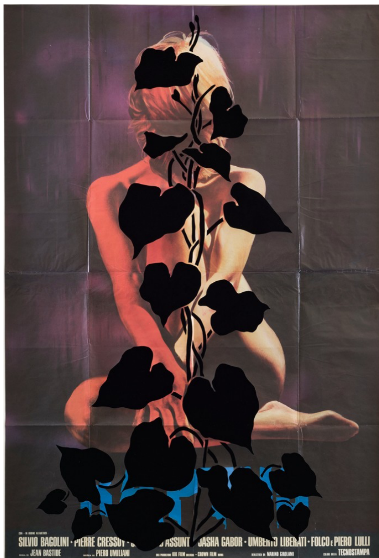
Raptus, 2015, paper and velvet, 79 x 55 inches.