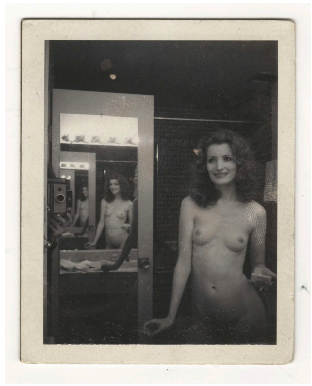
Left: UNTITLED (AT THE TABLE I), CIRCA 1978–82; COLOR POLAROID. Right: HOTEL CRILLON PARIS VIVA MIRROR 1969, 1969; BLACK- AND-WHITE POLAROID.

GANGITANO: There was a different idea back then of what it meant to be a successful artist. It's interesting that you used the art world itself as your material.