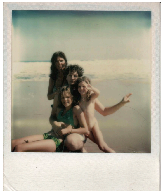
Left: VIVA POSITANO, 2007; INKJET PRINT ARCHIVAL INK ON ARCHIVAL PAPER. Right: UNTITLED (BEACH), CIRCA 1978–82; COLOR POLAROID.