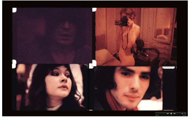
Left: CHELSEA GIRLS WITH ANDY WARHOL, 1967, 2015. Right: 16MM FILM TRANSFERRED TO DIGITAL VIDEO, SILENT; COURTESY OF MARTOS GALLERY AND MICHEL AUDER.

together, his works create a cohesive structure out of a flurry of uncomposed moments, out of the disorder of time, out of all of the things that dissolve when you're living your life. Auder's works are records of doing just that. When we met as Lower East Side neighbors in 1998, Auder was living at 188 Orchard Street, where he made a series of work by the same name; the 188 Orchard Street (2001) photographs were meticulously culled from 40 hours of intimate scenarios shot on video by the artist in his own apartment. His photographic works, like his film practice, rely on rigorous editing from an extensive amount of material. Internalizing the influences of his early contemporaries, ranging from the reductive tendencies of Warhol to the naturalistic, intimate styles of Frederick Wiseman and Robert Frank, Auder developed a unique signature that fluctuates between closeness and distance, between insider and outlaw. Auder has, perhaps, always wanted it both ways, and found that it was possible using the medium of video in the late '60s and '70s: he could record everything around him and do something with it later. Maybe.