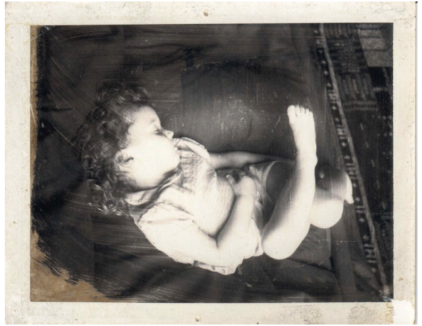
Left: UNTITLED (HEADBAND I), CIRCA 1978–82; COLOR POLAROID. Right: UNTITLED (ALEXANDRA SLEEPING), 1973; BLACK-AND-WHITE POLAROID.

AUDER: Yeah, but it's still frightening, the people who Trump has brought to the surface. That hatred has always existed in the United States, it's not something new, but now it's supported by the government. It seems like it's only going to get stronger and stronger.