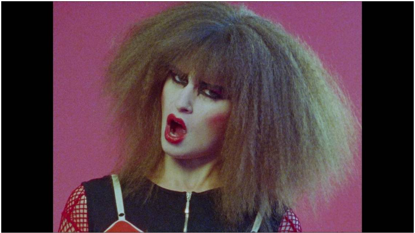
Screen shot from Dara Friedman's "Dicther," 2017.

early 20 th century German films. Sometimes the voices are angry and are shouting, producing a chaotic sound and atmosphere; sometimes the recitations are quieter, and it all becomes disorienting.