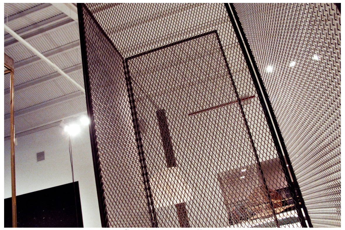
Carol Bove installation