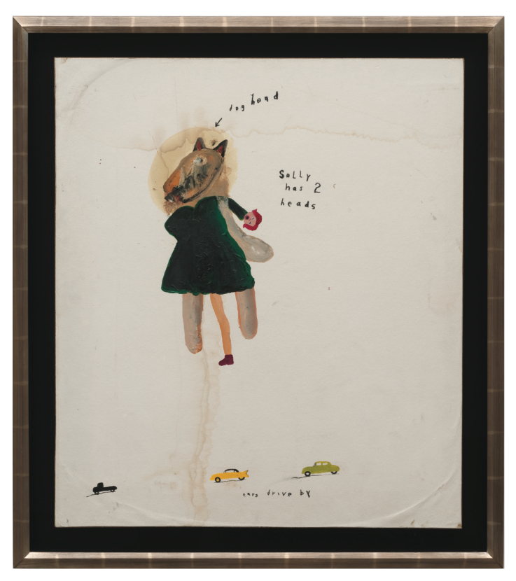
David Lynch, Sally Has 2 Heads , 2013. Mixed media on paper mounted to wood panel, 31 x 27 inches.

In this sense, too, Lynch's late paintings are stylistically and thematically retrograde. They don't move. His childlike factories and rotary phones idle in the same mid-century iconicity as his notion of what art is, or is for. Lynch's advocates detect an echo of Edward Hopper's diners, say—not to mention his gas stations—but so what if every fluffy stack of pancakes is drizzled with bile? Art "reveals"—but reveals what? Airplane and Tower (2013) depicts an elongated plane with a Korean War-era cockpit hurtling towards an obelisk of scaffolding—dare we say, a Washington Monument of the soul. If we perceive something sinister in the juxtaposition of these two simple, innocent shapes, the idea goes, it is because Lynch has channeled an anxiety we've been unable to name. But has he? The work is post- 9/11, and anyway this kind of disaster-masochism isn't such a subconscious so much as a conscious part of the American psyche. What-ever gothic pyromania and domestic abuse seeps through Lynch's cracks has been preempted by (not just his own films, but) the Dada collage of early punk, of the internet, and of the news.