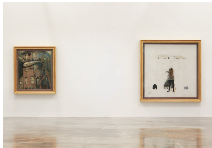
David Lynch, I Was A Teenage Insect , 2018 (installation view).

When film grinds to a halt, you have photography—but painting comes just as close to the prosody of all those stalled sports cars, hermetic and inert—the way David Lynch might paint them as black cartoons. "Sally's in the Kitchen," reads one of Lynch's 2013 drawings. Sally isn't pictured. Instead, a plane strafes the ground (emitting bullets, or punctuation, or turds), a man throws up his hands, and the hood of a vintage car erupts in smoke. In Sally Has 2 Heads (2013), it's true: a ragdoll rendering of a girl in a red dress has, capping her sloping left arm, a girl's head, and, on her proper neck, the muddy face of a German shepherd, labeled "Dog head." The only other marks on the paper, towards the bottom, describe a row of three cars—green coupe, yellow convertible, black pickup truck—all styled with the languid lines of the 1950s. Their immobility denies the caption: "cars drive by."