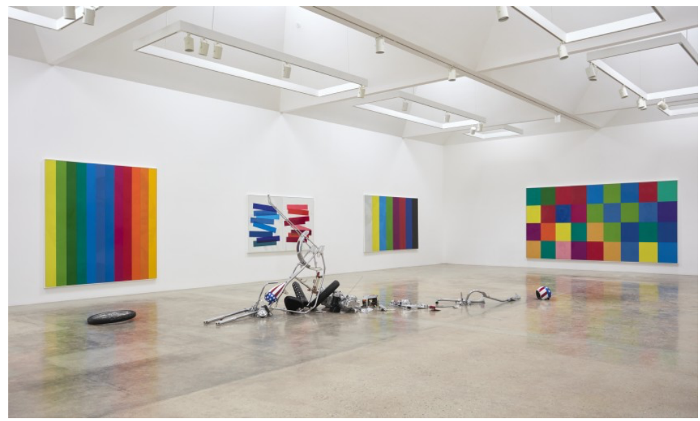
An installation view of Hank Willis Thomas' solo show at Kayne Griffin Corcoran, with the sculpture "Not So Easy," inspired by "Easy Rider," in the foreground. (Kayne Griffin Corcoran)

The piece is titled "A Suspension of Hostilities," a phrase used by the military to indicate a truce; it was commonly used at the close of the Civil War.