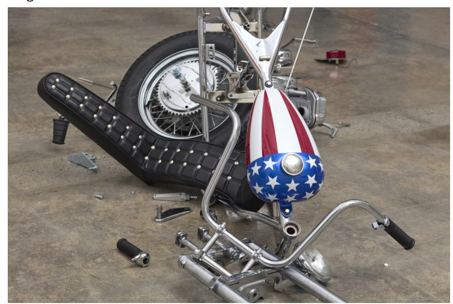
An installation view of "Not So Easy," 2019, by Hank Willis Thomas.

"People bring themselves to the work," he says. "Like how many people does it take to make a movie? .... It's so important to acknowledge them."