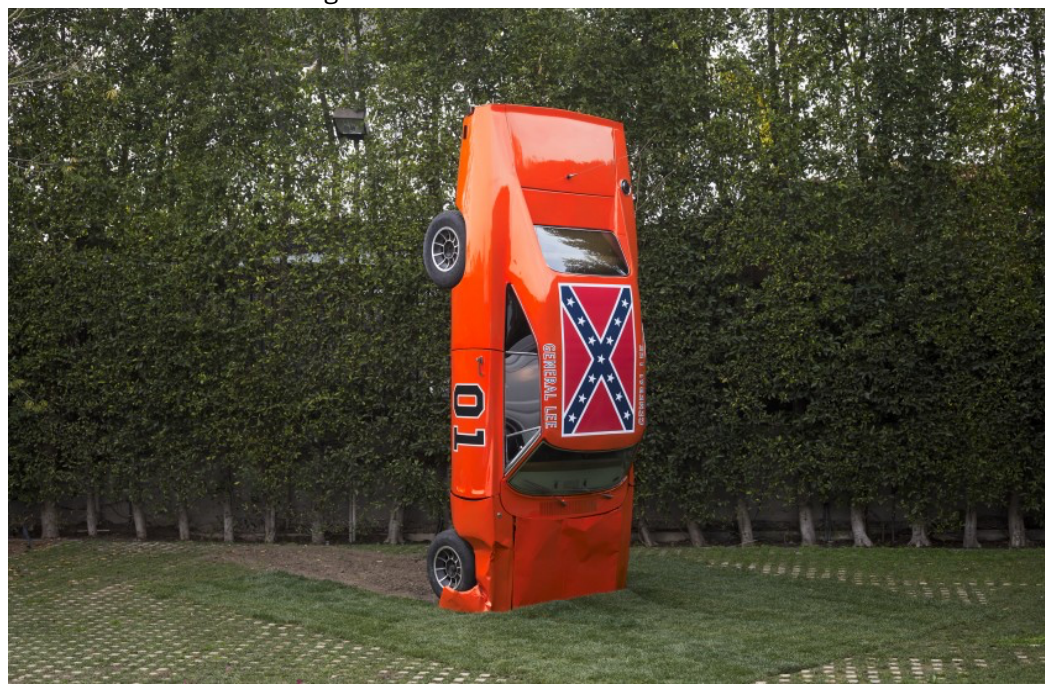
Hank Willis Thomas's "A Suspension of Hostilities" is inspired by the Dodge Charger featured on "The Dukes of Hazzard."

... in a vehicle named for a Confederate general.